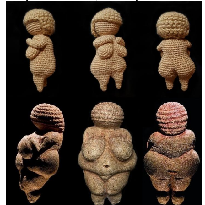
Abbildung 1: The crochet Venus in comparison to the original Willendorf Venus

To make her resemble even more the original Willendorf Venus, I sewed a belly button and additionally tried to emphasize her belly fat and knees.